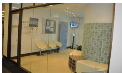
Up close: the facade of our stylish NZVAC in Sydney's CBD

Our shared premises combine resources, infrastructure and expertise that deliver savings to client governments, while ensuring that discrete process and security protocols are maintained. We have a clear understanding of services expectation of both DIBP and INZ, their legal frameworks, cultures and end-customer needs, while constantly safeguarding the privacy of clients' data and the security of their documents.